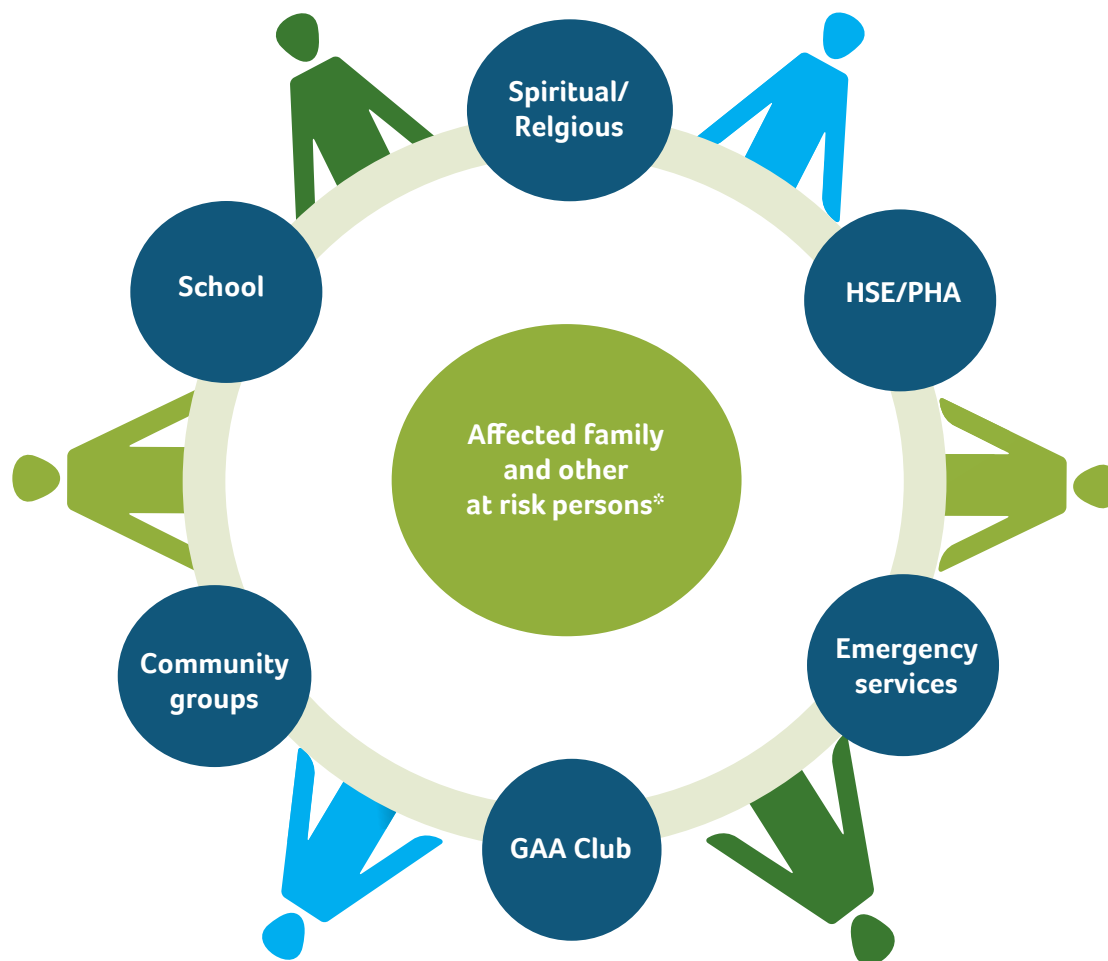
Figure 2: Some potential participants involved a community - based response to a critical incident.

* In addition to the individuals directly affected, other 'at risk' persons are amongst those most likely to suffer distress as a consequence of an incident. Evidence would suggest that these may include those who: